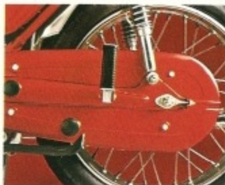
Advantages of a chaincase include keeping the bike and rider clean, long chain life.