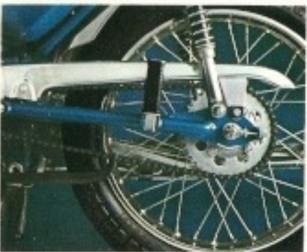
Honda also offers this light, sporty chain guard if you prefer it to a full chaincase.

Honda's big single is certain to delight the sports rider who demands the tops in light, low cost riding thrills matched with sleek styling and the most handsome modern colors. It will out-ride everything in the small bike class, with a terrific 5-speed transmission geared for a top speed of 110 km/h (nearly 70 mph). The light aluminum alloy single engine revs out a tremendous 12 horsepower at a rapid 9,000 rpm to let you blast off the line and zoom right up to top speed very quickly indeed. That's the beauty of an overhead cam. OHC quick-revving power at the flick of a wrist. As an added bonus, the 4-stroke single grinds out gobs of torque, making this bike easy to handle even in town with a lot of slow-moving traffic. It doubles nicely for the enthusiast who needs to use his bike for business during the week. The Honda 125S Single also rides and handles easy with its pipe frame, narrow profile and great stability—fine for the tight spots. This bike's got all the Honda sports features, too, like the separate speedometer and tachometer, quick-stopping brakes, lockable gas cap and tuck-and-roll dual seat.