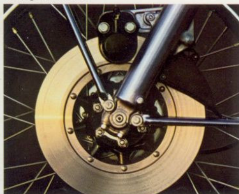
CB-750 K4 A big disc brake up front gives you plenty of smooth stopping power.