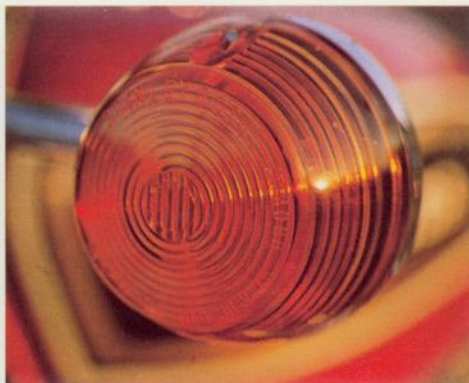
CB-750 K4 Large turn signals let others know where you're headed.