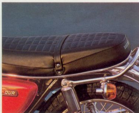
CB-550 Large, comfortable seat with locking helmet holder, map compartment.