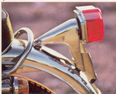
CB-550 A grab bar behind the seat and a large taillight for visibility.