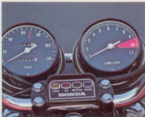
CB-750 K4 Full instrumentation and indicator lights are easy to read.