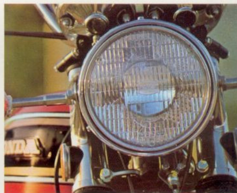
CB-750 K4 Actuate the large headlight, and running lights come on automatically.