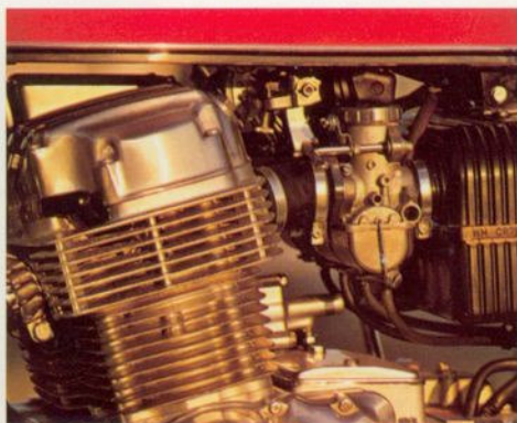
CB-750 K4 Honda's famous four-cylinder, four-stroke engine moves you out.