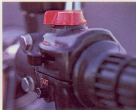
CB-550 Electric starter, lighting, ignition cutoff all at your fingertips.